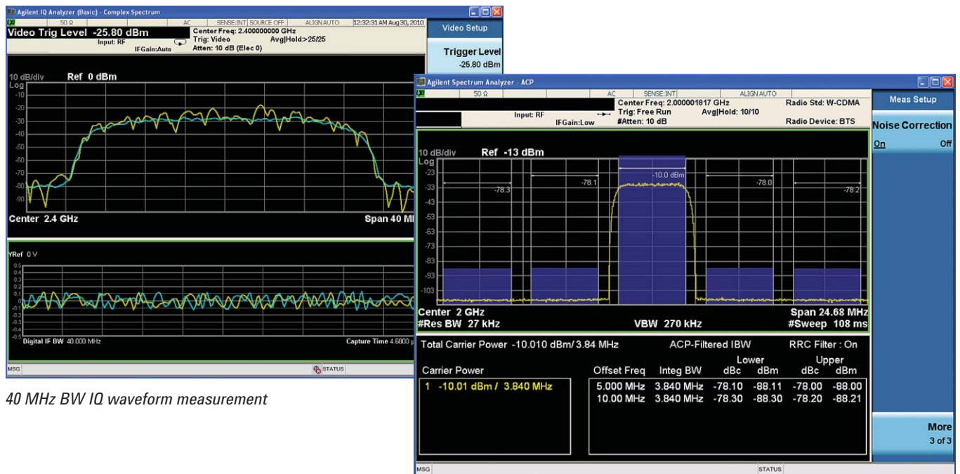
40 MHz BW IQ waveform measurement