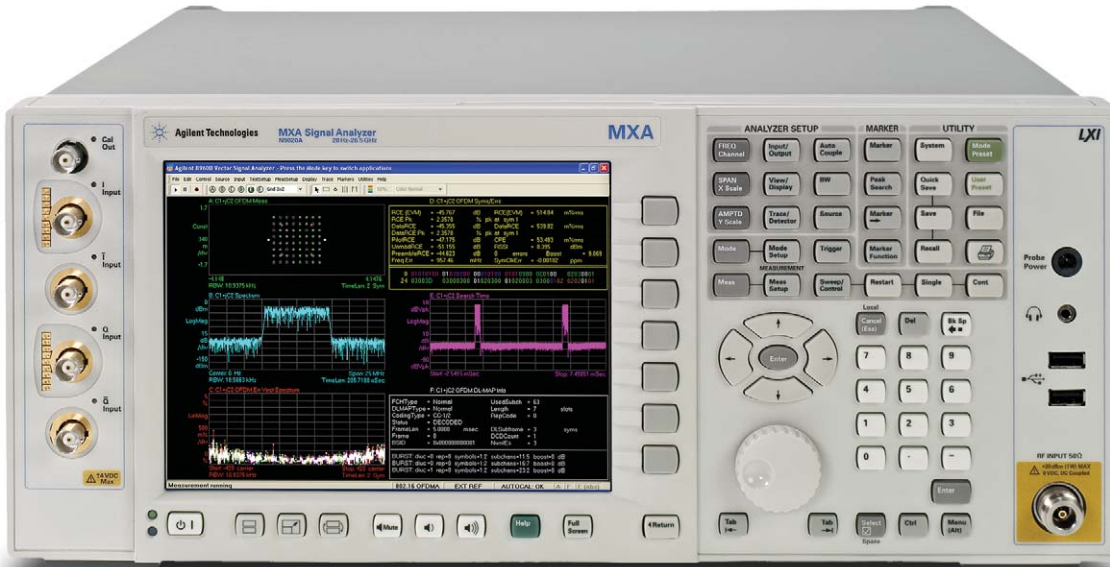
N9020A MXA signal analyzer—built for speed

During the transition from product design to the production line, every device demands decisions that require tradeoffs in your goals—customer specifications, throughput, yield. With a highly flexible signal analyzer, you can manage and minimize those tradeoffs. Agilent’s mid-performance MXA is the ultimate accelerator as your products move from design to manufacturing to the marketplace. It has the flexibility to quickly adapt to your evolving test requirements—today and tomorrow. Maximize your flexibility, ramp up faster, and accelerate to market with the Agilent MXA signal analyzer.